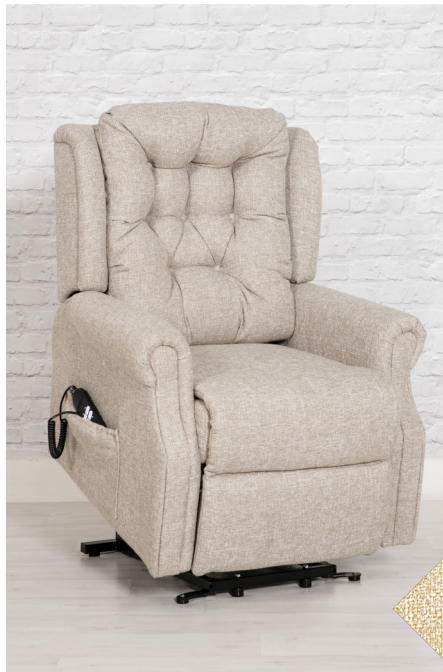
■ MIL-340-SA Twin Motor Lift Chair Sand